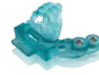
VarseoWax Surgical Guide Surgical guides and placement aids for implant prosthetics