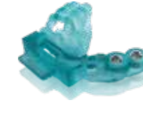
VarseoWax Surgical Guide Surgical guides and placement aids for implant prosthetics