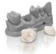
VarseoSmile Crown plus Permanent single crowns, inlays, onlays, and veneers