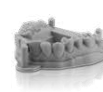
VarseoWax Model Dental models