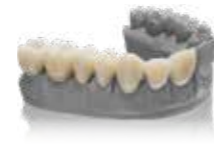
VarseoSmile Temp Temporary crown and bridge restorations, inlays, onlays, and veneers