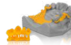
VarseoWax CAD/Cast Burnout objects