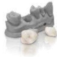
VarseoSmile Crown plus Permanent single crowns, inlays, onlays, and veneers