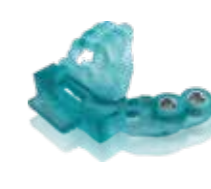
VarseoWax Surgical Guide Surgical guides and placement aids for implant prosthetics