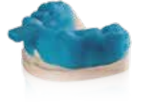
VarseoWax Tray Individual impression trays