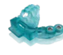
VarseoWax Surgical Guide Surgical guides and placement aids for implant prosthetics