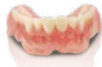
VarseoSmile Teeth Denture teeth