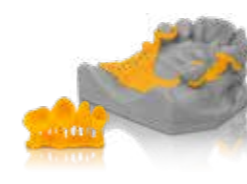
VarseoWax CAD/Cast Burnout objects