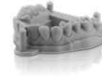
VarseoWax Model Dental models