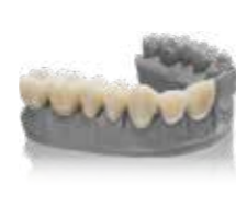
VarseoSmile Temp Temporary crown and bridge restorations, inlays, onlays, and veneers