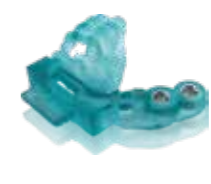
VarseoWax Surgical Guide Surgical guides and placement aids for implant prosthetics