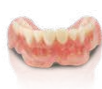
VarseoSmile Teeth Denture teeth