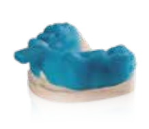
VarseoWax Tray Individual impression trays