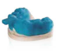
VarseoWax Tray Individual impression trays