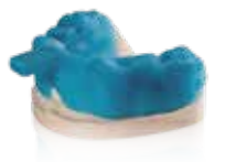
VarseoWax Tray Individual impression trays