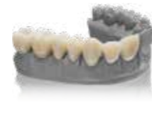
VarseoSmile Temp Temporary crown and bridge restorations, inlays, onlays, and veneers