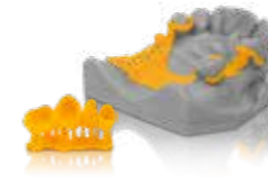
VarseoWax CAD/Cast Burnout objects