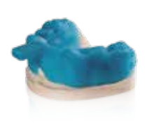
VarseoWax Tray Individual impression trays