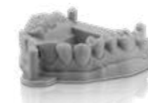
VarseoWax Model Dental models