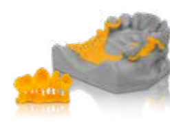
VarseoWax CAD/Cast Burnout objects