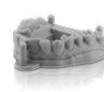
VarseoWax Model Dental models