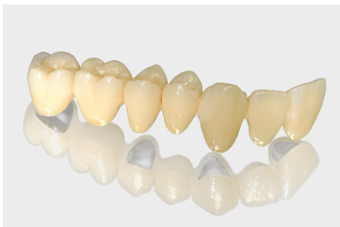
Outstanding bonding strength with all leading ceramic materials